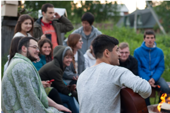
Our global project to Russia won't be taking place for the first time in 20 years!

After the cancellation of my projects, I suddenly found myself getting very frustrated at the impact of what we're going through. Where is God in everything that is happening? I've spent much of my time over the last 6 months working on these projects. Has it all been in vain?